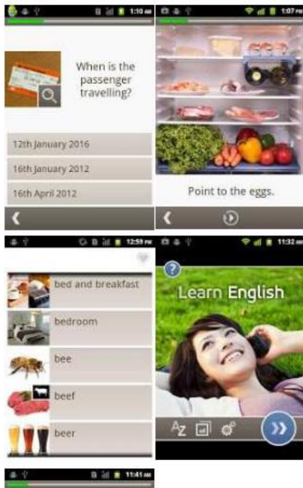
Figure 3 Display Learn English

application was originally designed for immigrants who need health insurance to public facilities in the UK.