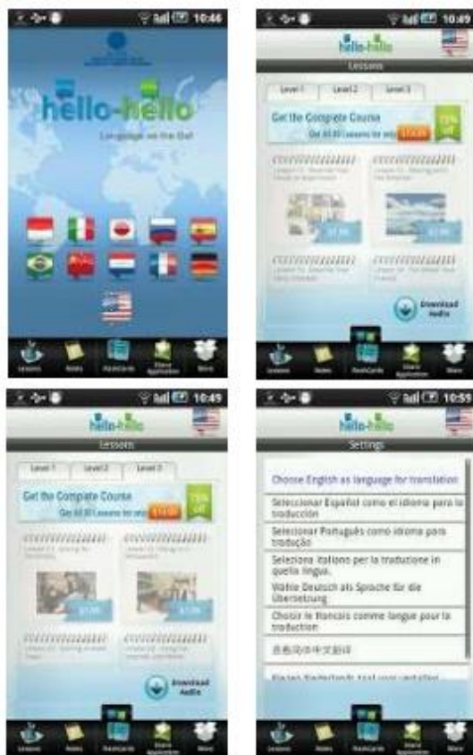
Figure 2 Hello-Helo

Hello-Hello does not deploy any prize or other features to motivate its users. The social media feature on its website offers and receives feedback on oral and written exercises, but this is not available in the application features. However, access to material that is easy and can be downloaded on mobile phones and practiced anywhere without an internet connection, strongly supports the autonomy and motivation of learners