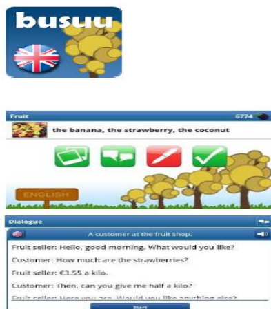
Figure 1. Busuu Display

This application is a part of its website version ( www.busuu.com ) which is an online language community with members of more than 25 million people who offer learning 12 foreign languages. According to information from the provider website, the development of this application begins with the developers ' equipment about English teaching methods that are too expensive and boring, so they decide to create their own teaching materials with sound and images that allow their users to learn directly from native speakers at no charge to the some of the material. Users can access features in full by paying Premium membership at a cheaper price than face-to-face courses in the real world.